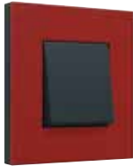
natural soft red