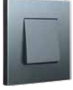
alu steel grey