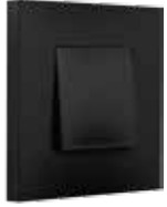
Bakelite® piano black