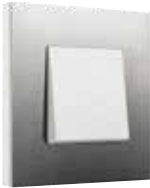
stainless steel on white