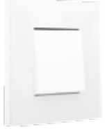
liquid snow white