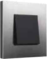
stainless steel on anthracite

Do you love an ultra sleek design in timeless materials? Then you will love the refined look of Niko Pure. A series made from special materials full of character and emotion such as bamboo, stainless steel, Bakelite and Plexiglass. Your guarantee of an elegant and sustainable finishing. Top design, made affordable.