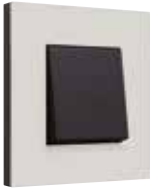
natural soft grey