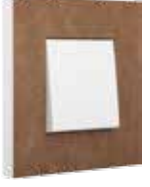
skin sensation cinnamon